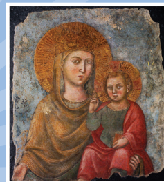
Our Lady of the Way