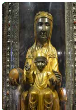
◀ Feast of BVM, Mother of the Society of Jesus

'May Mary continue to watch over the Society of Jesus so that every member may carry in his person the "image" of the Crucified Christ, in order to share His Resurrection.'