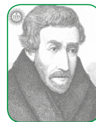
▲ S Peter Canisius

Mary, Mother of the Society of Jesus, pray for us.