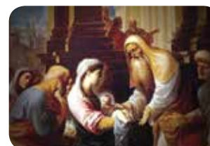
♦ Presentation of the Lord