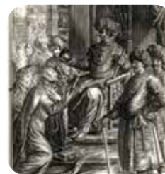
♦ Bl. Rudolph Aquaviva