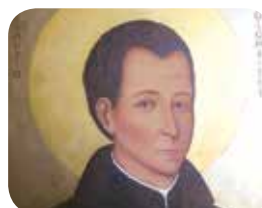
♦ St. Claude La Colombiere