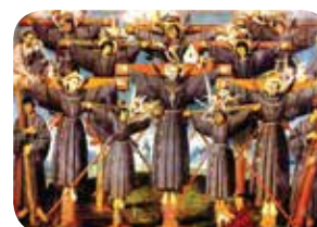
♦ Sts. Paul Miki & Companions