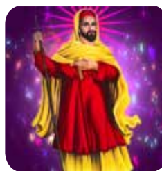
♦ St. John de Britto