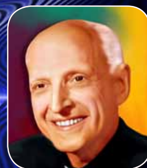
Fr. Pedro Arrupe