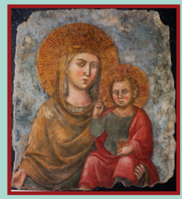
Our Lady of the Way