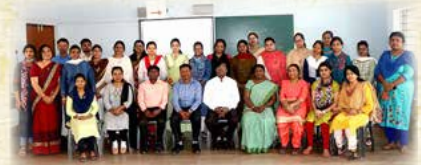
NEP at Carmel Jr College

get ready for their third-semester exam. The hostellers are asked to stay outside in PG as official permission to open the hostel for them is ruled out.