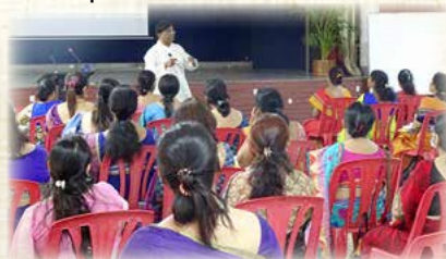
NEP at Loyola School, Telco

Taking into consideration the effect of the pandemic, the school is still open to absorbing the remaining numbers for admission as they come to fill the gap in LKG. Some are still coming during the month of March. The good news is that many parents came and cleared their fees, about fifty more are expected to do the same.