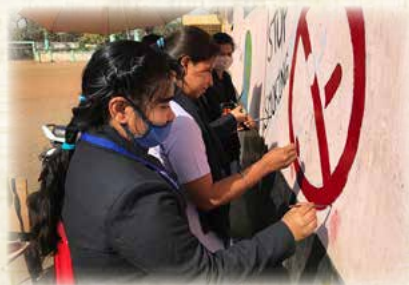
Practic Teaching - Kabiriya Urdu H School, Dhatkidih

As lockdown continues, LCE sees students out of campus. The second-year students are engaged in Practice Teaching at Six Government-run Schools and Loyola Project School. They will end their exercise by Mid-April and