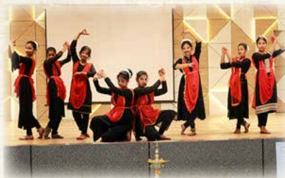
Orientation for Parents