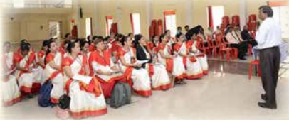
NEP at Adra