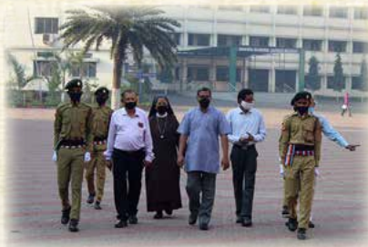
Welcome to Fr Provincial

A Parent-Teacher meeting of Std XI students was conducted on 27 February to motivate students to attend the offline classes regularly from 1 March.