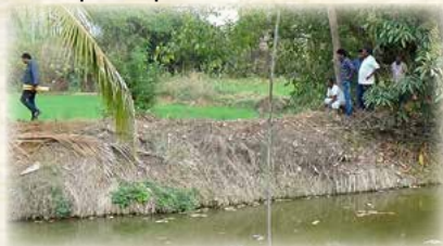
Measuring the land for demarcation

not allow to hold the Women's Day Program on 8 March in Tumudibandha. Adhering to the government norms and restrictions, we had it on 10 March, in Dengamaha village of Sartul Gram Panchayat. This is an interior area where very few NGOs are working. The presence of government officials and their activities are distressingly minimum. Nowadays, the rural folks are busy collecting seasonal Mahuwa flower , so they assembled late but in good number, especially women. This was perhaps for the first time