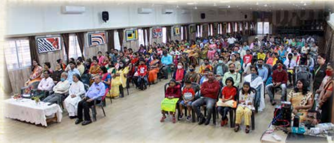
Orientation for New Students