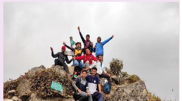
Scholastics Climb to Japfü Peak

God makes all things beautiful in time. The Jesuit Training College Jakhama is made perfect by bringing in a competent