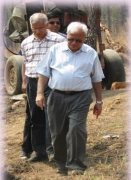
RS visits the Campus