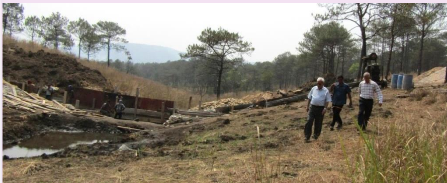
Regional Superior inspecting the Check Dam

Novices were all excited as they were getting ready for the Sunday village ministry on Feb 28 th after a gap of almost a year due to Covid restrictions. The First years, all of whom are non-Khasis, were found memorising the Khasi prayers and brushing up the little Khasi they had picked up during the weekly classes, as they had no opportunity to learn Khasi staying in the villages before joining the novitiate. With every Sunday in the village, all of them are becoming more and more confident with their ability to communicate in Khasi.