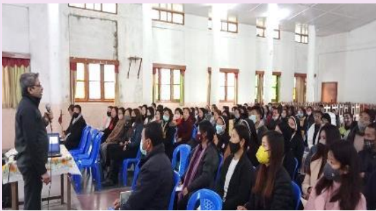
Seminar on Child Protection