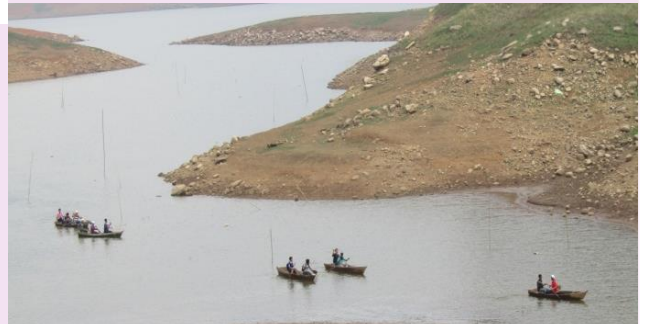
Novices at the Sea of Barapani, Mawlyndep

On 19 th of April, the novices had their villa-day at the sea of Barapani. They had the joy of imagining and experiencing Jesus in the Lake at Galilee. They came back tired, yet filled with " were not our hearts burning ", while we were at the sea in the boat and also in our fellowship meal by the lakeside.