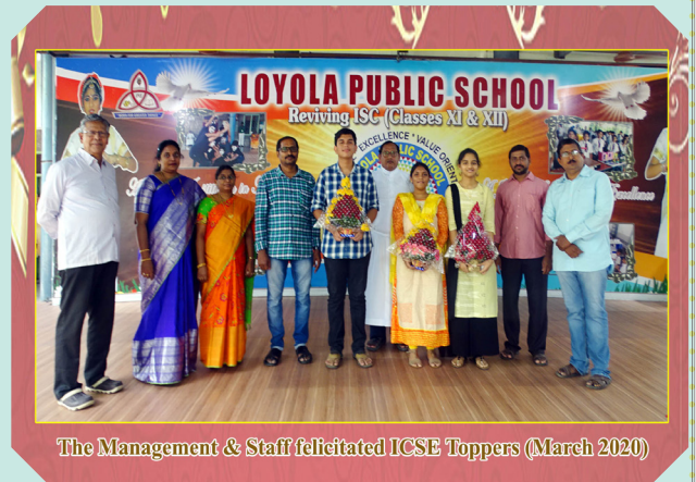
The Management & Staff felicitated ICSE Toppers (March 2020)