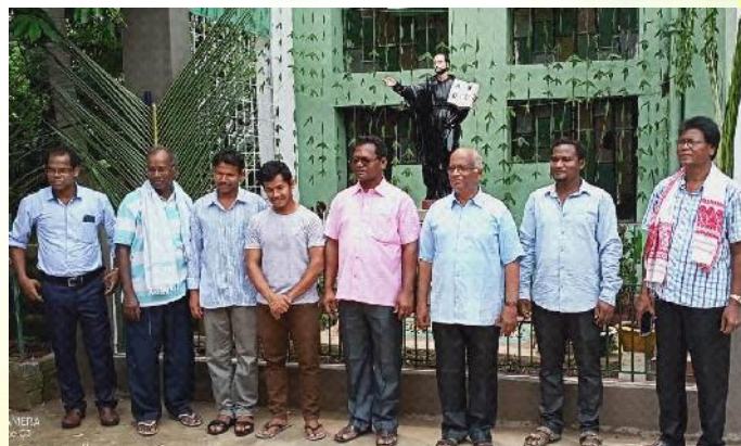
Feast of St Ignatius of Loyola at St Xavier's, Sahibganj