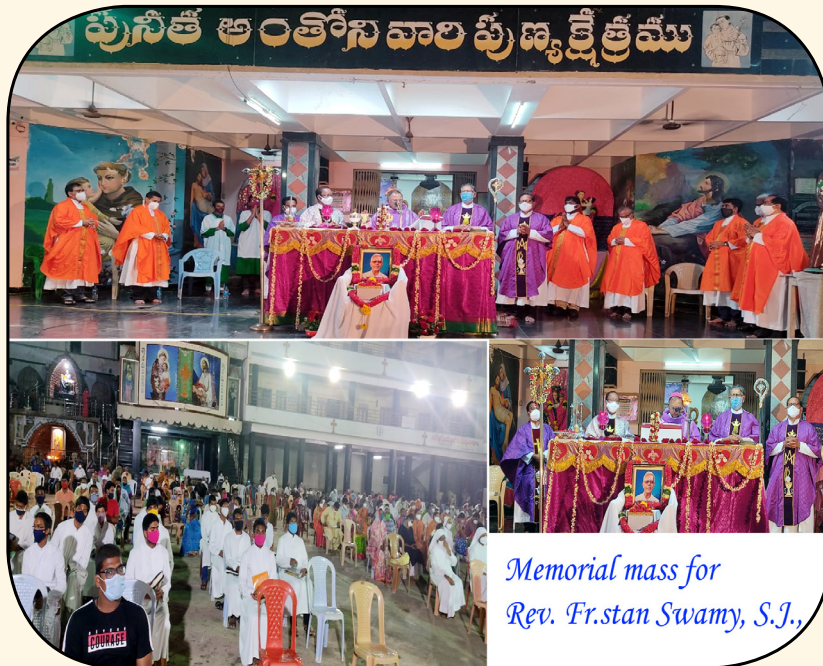
Memorial mass for Rev. Fr. Stan Swamy, S.J.,

The month of Jul was a grace-filled month for Loyola Institutions, Karimnagar. The institutions began their academic year and resumed online classes with the best teaching aid. Loyola English