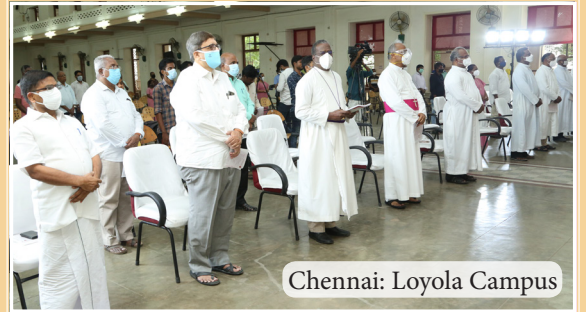
Chennai: Loyola Campus