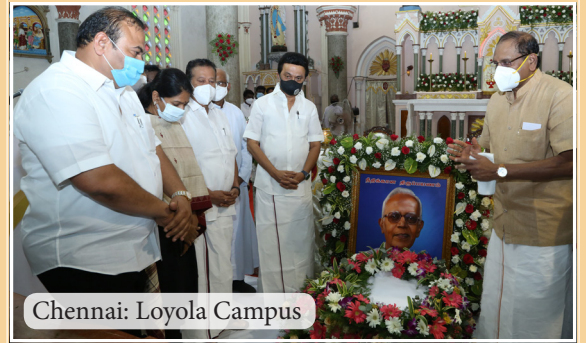
Chennai: Loyola Campus