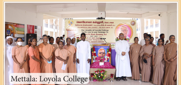
Mettala: Loyola College