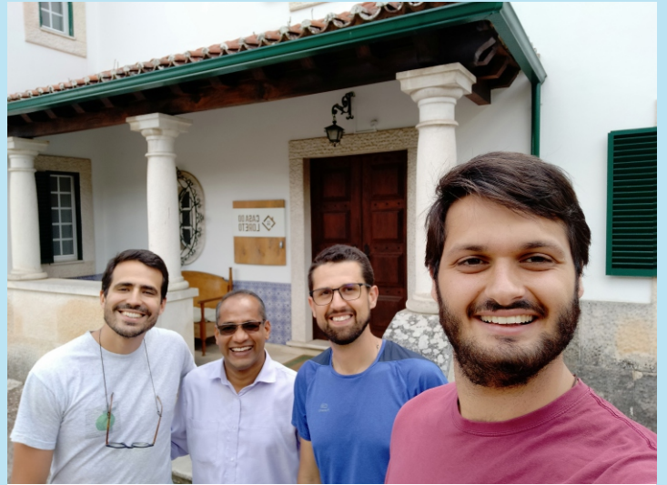
Jesuits from Portugal.

Coimbra. The first Jesuit residence (“college”) in Portugal was established in Coimbra in 1542. Coimbra also had a massive Jesuit Church and one of the earliest Jesuit novitiates in Europe. These three Jesuit structures existed within the Coimbra State University campus through the patronage of King John III. Coimbra State University is one of the oldest universities in Europe established in 1290. The Jesuit church today is known as “Se Nova” i.e. the New Cathedral of the Coimbra Diocese. Its main altar has the statues of St Ignatius, St Francis Xavier, St Aloysius, and others. The Jesuit influence in Portugal continued, until 1759, when Marques de Pombal expelled the