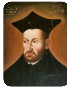
▲ S Peter Faber