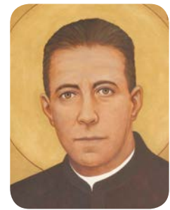
▲ S Alberto Hurtado

Into that heaven of freedom, my Father, let my country awake.