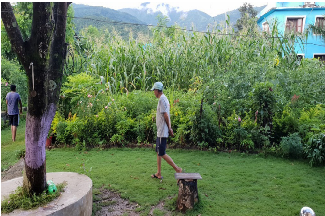
Garden in front of new rented house

and Social Service center. They showed a lot of interest in helping us in our new mission. On the teachers Day (Guru Purnima) the SCN Sisters organized a special Mass with the Catholic faithful and prayed