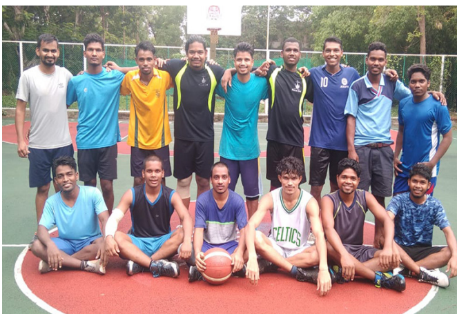
Premal Jyoti scholastics ready for Ignatian football tournament