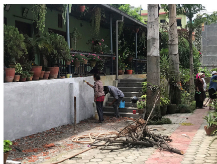
Painting work on veranda wall