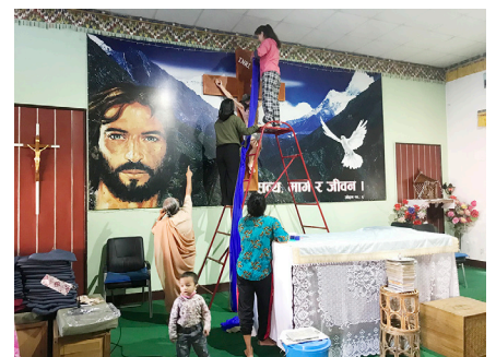
Decoration is in progress

of lockdown. They contributed their physical labour to remove church hall staircase, to repair the other, and then finally clean up entire church premises for the feast. Now, front part of the Church has a wide