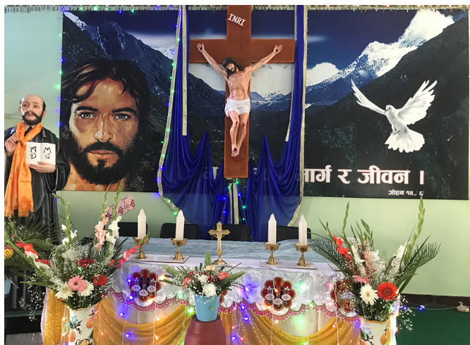
All set for online Holy Mass on Zoom

choir and now for St. Ignatius Feast Day Novena.