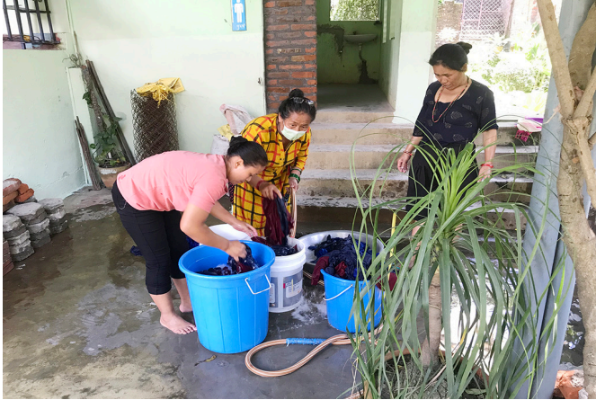
Cleaning of church premises by women

As lockdown was partially lifted, the parish priest