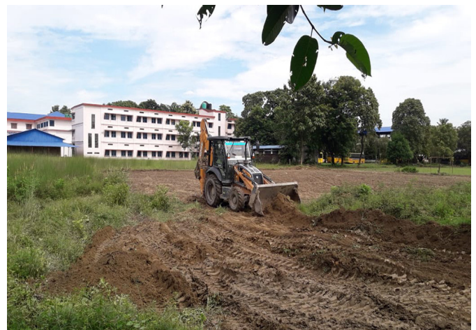
School compound is extended