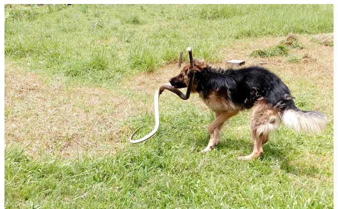
Lucky attacks uninvited intruder