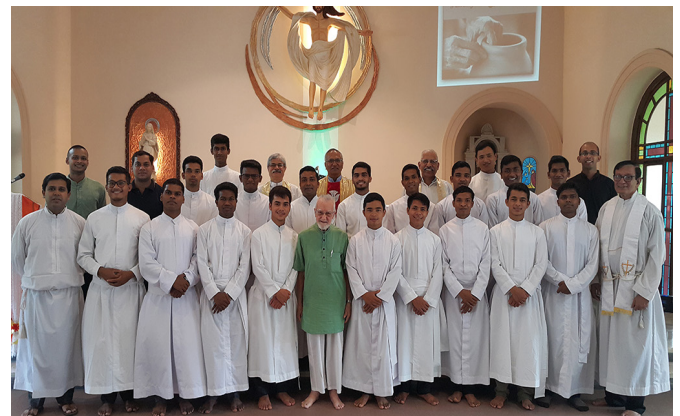
New Juniors & novices with their formators