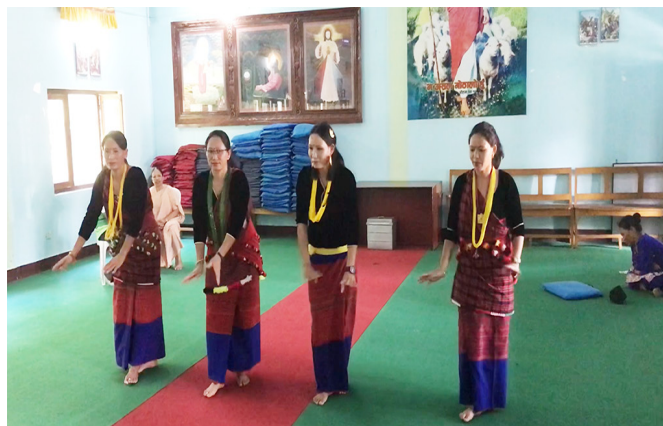
Those parishioners who attended onsite mass participating in cultural dances