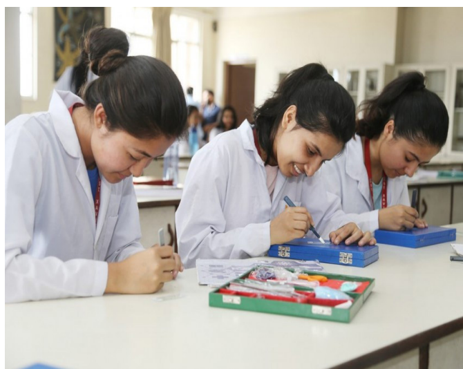
Students in their respective labs