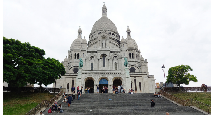
Sacred Heart Church, Paris