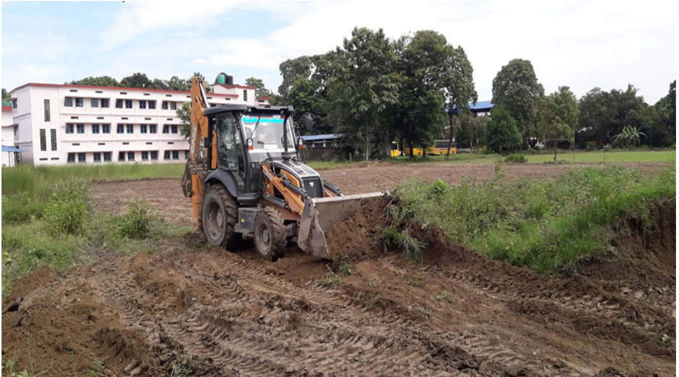
School compound is extended

The campus has been getting a 'make-over' while the students are away.