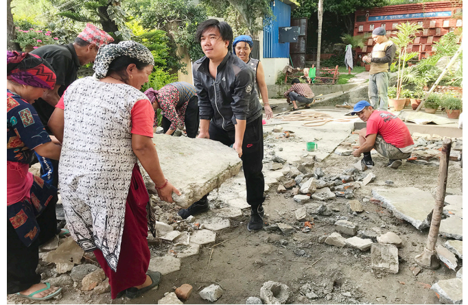
Parishioners expanding the front lawn