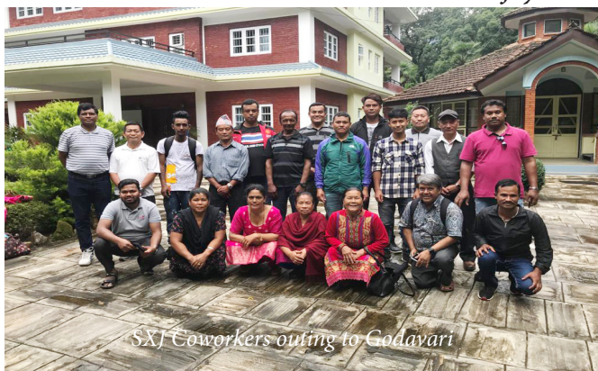
SXJ Coworkers outing to Godavari