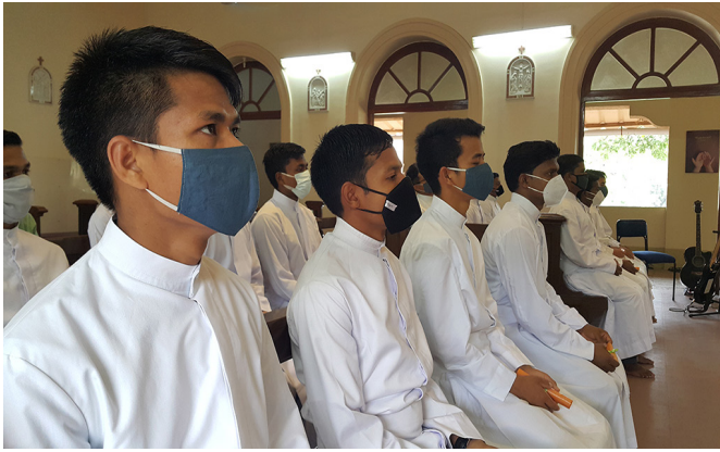
New Juniors in Vinalaya

The first step towards getting somewhere is to decide that you are not going to stay where you are”, says J.P. Morgan.