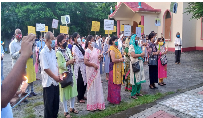
Parishioners participating in the rally