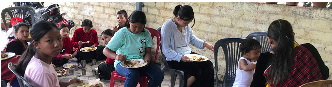
Some parishioners enjoying feast day agape in the chruch premises