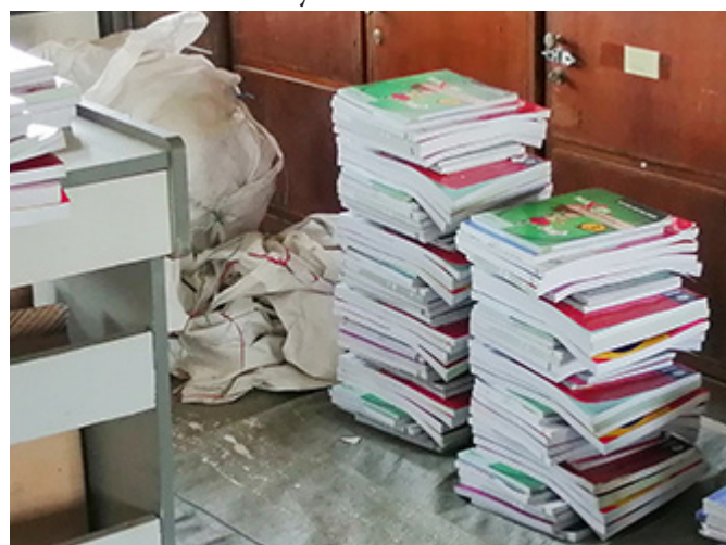
Books ordered for new academic session

in the groups many clusters are created according to their proximity from each other, where teachers can come and teach and check students' home works. Last year, teachers went to their assigned areas twice