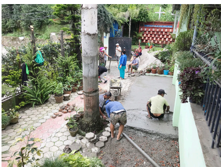
Congretizing the new front lawn

On the occasion of Ignatian Year and also for the preparation of the parish feast, parishioners came together more than three times during two months