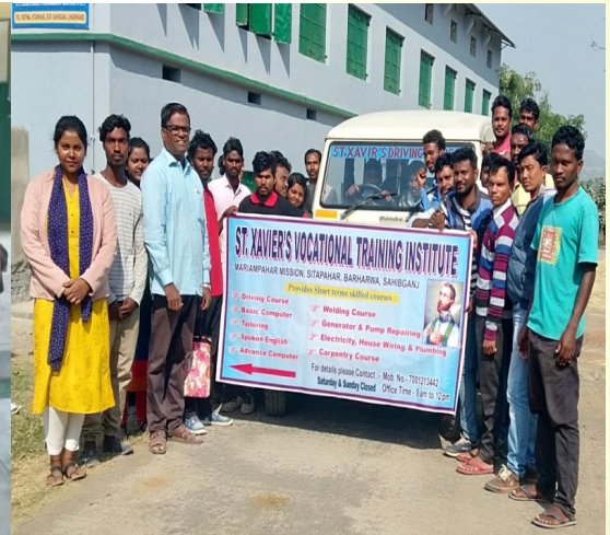
St Xavier's Vocational Training Centre at Mariampahar Starts Driving School