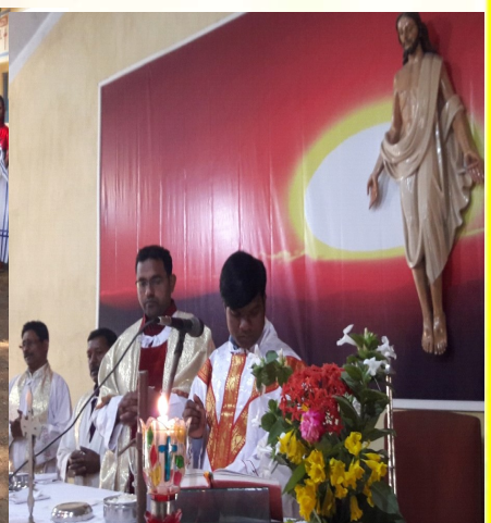
Second Priest from Jibonpur Parish