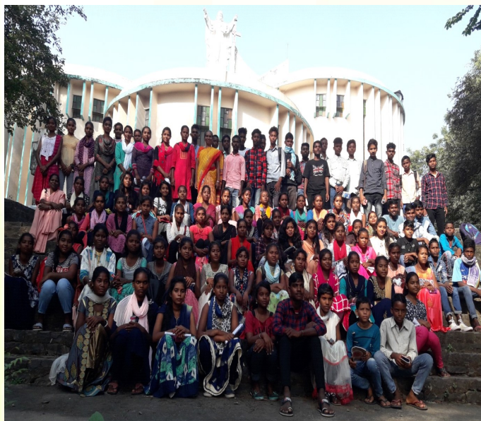
Youth Camp at Mariampahar