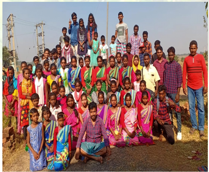
Youth for Jesus at Hasapathar