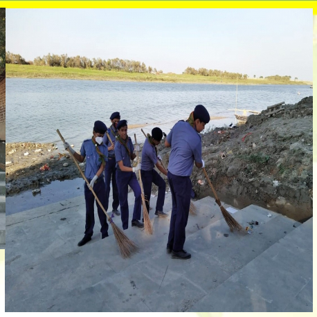
Cleanliness Drive by St Xavier's, Sahibganj