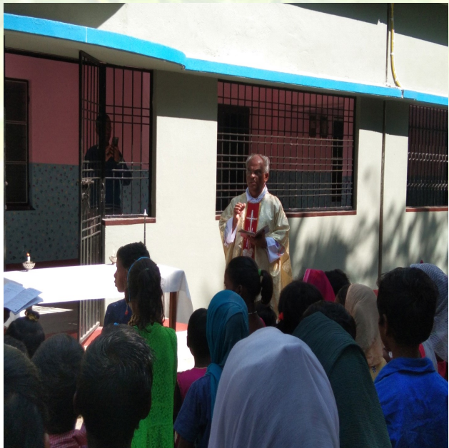
Fr Provincial Blesses the Newly Built Hostel Building and the Renovated Church Building at Nichitpur