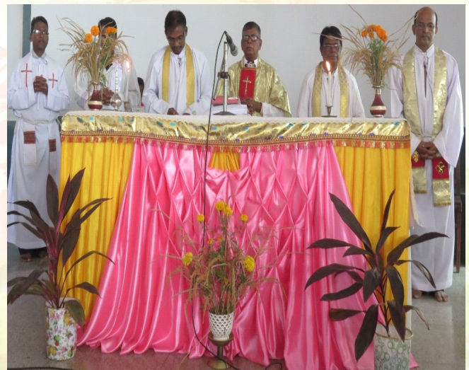
Christ the King Feast at Hathimara