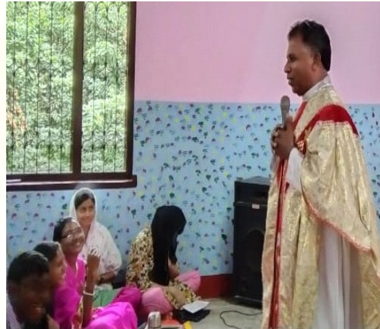
Seminar at Nichitpur