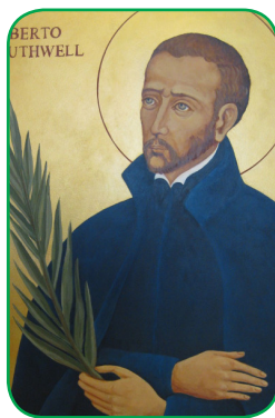
St. Robert Southwell