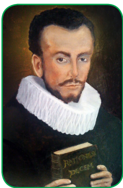
St. Edmund Campion