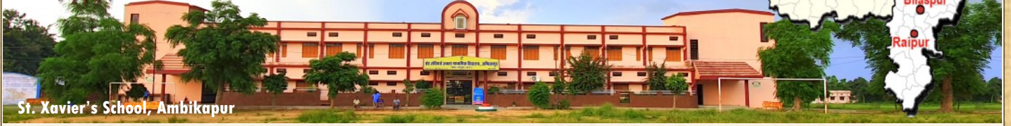
St. Xavier's School, Ambikapur