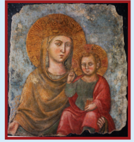
Our Lady of the Way