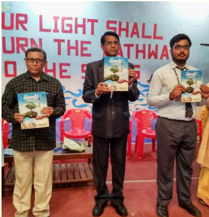
“Seeds” St Xavier’s School, Sahibganj