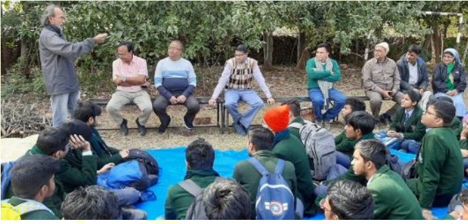
Blanket Distribution at Banpokharia