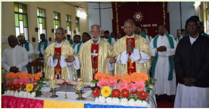
Jubilee Celebration on 30.12.2020