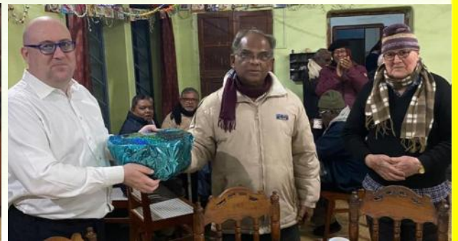
High Commissioner of Malta in Jisu Jaher, Dudhani