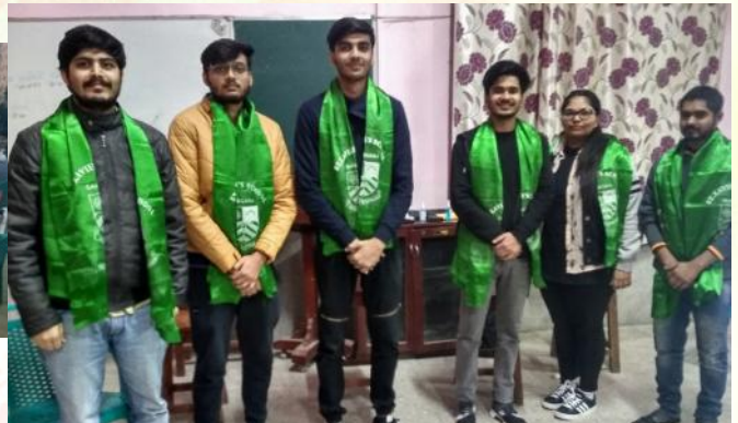
LTS, St Xavier's Sahibganj