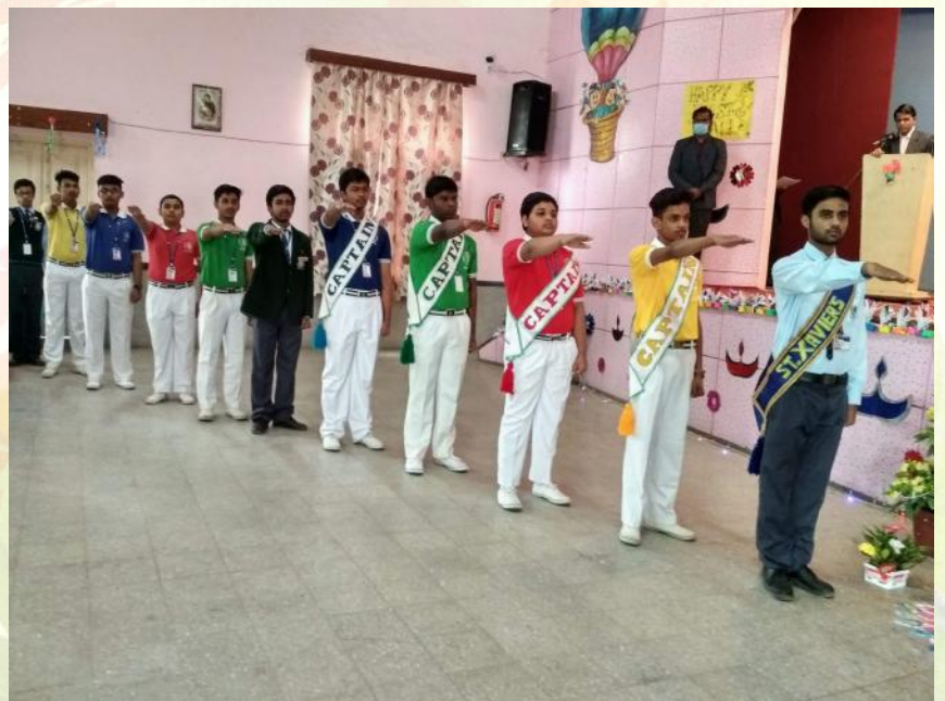
Oath-taking St Xavier’s School, Sahibganj