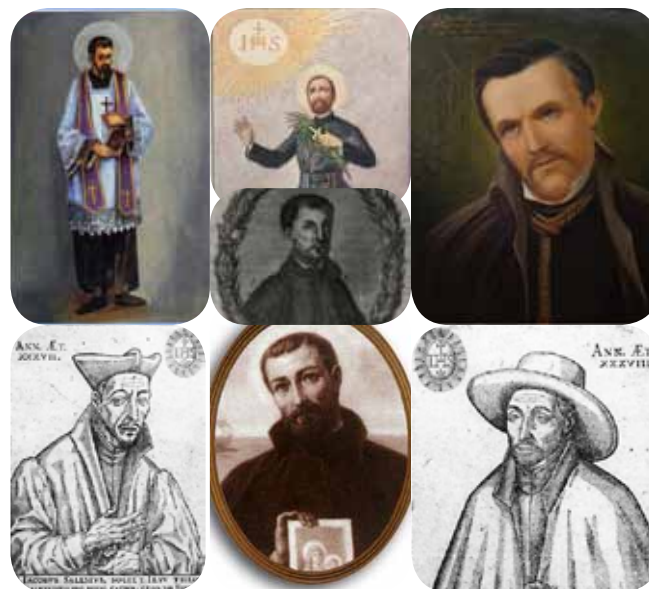
▲ 19: Sts. John Ogilvie, Stephen Pongracz, Melchior Grodziecki; Bl. Ignatius de Azevedo, James Sales & William Saultemouche and their companions, Martyrs for Catholic Faith

On this titular feast of the Society we pray to live up to the name we bear.