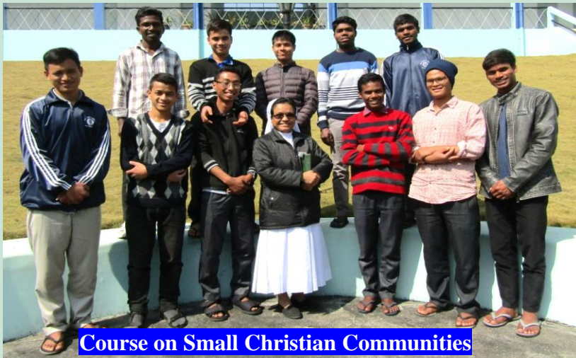
Course on Small Christian Communities