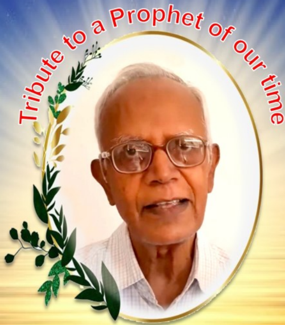
FR. STAN SWAMY, S.J.