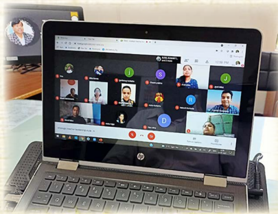
Pep Talk to Staff of St Francis School, Bambra on 22 May