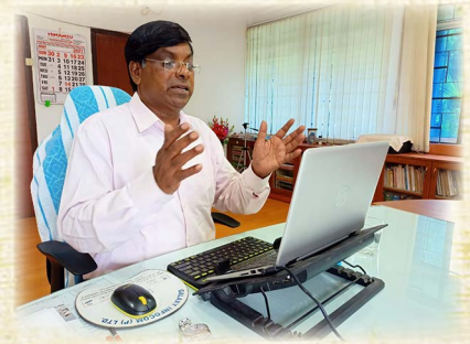
Pep Talk to Staff of St Francis School, Bambra on 22 May