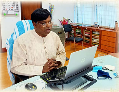
Talk to Nurses of AIIMS, Delhi on 12 May