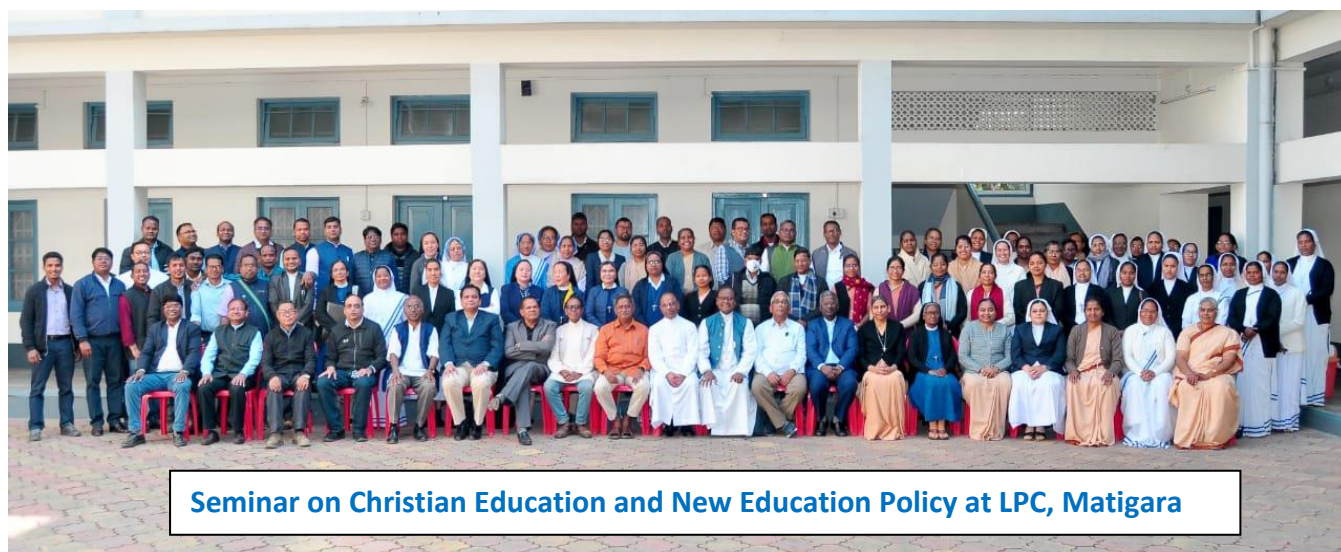
Seminar on Christian Education and New Education Policy at LPC, Matigara