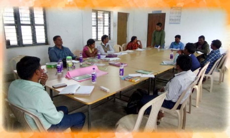
ToT for Lok Manch staff at OCI Campus