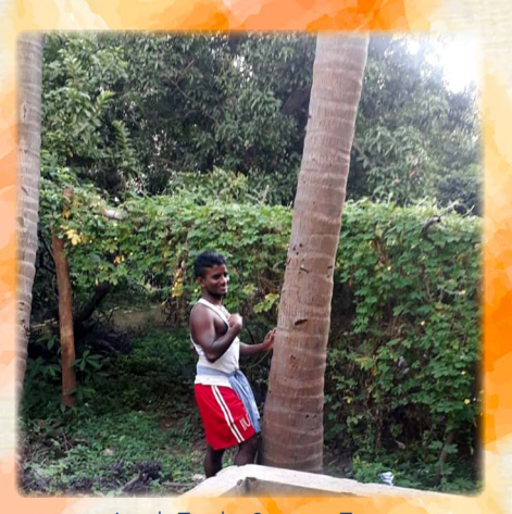
Arun's Tender Coconut Treat