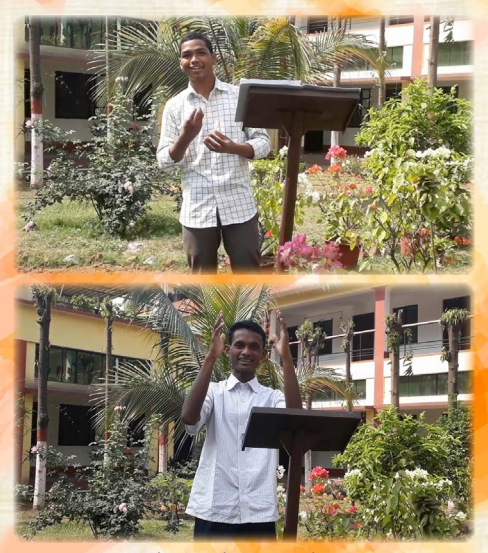
The Garden Speeches

on the back burner as it was too close to his recent heart surgery.