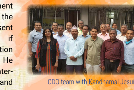
CDO team with Kandhamal Jesuits

OCI conducted ToT for the staff on 20 February. The resource