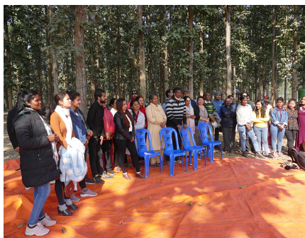
School staff picnic