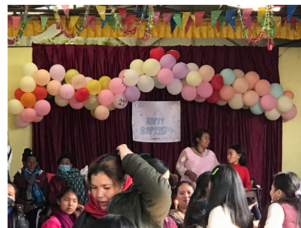
Celebration of a Baptism for a baby girl