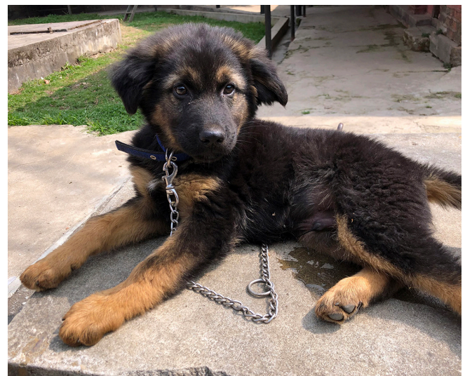
new bhote dog “SHINGHAM”