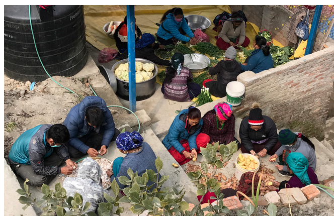
Prem bhoj in honor of Baptism