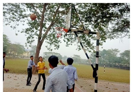
Students get coaching in Basketball game