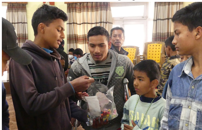
Talent show by children

Month of January went smoothly till the end. We had an awareness program at St. Xavi-