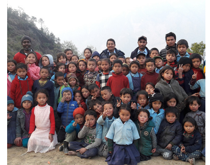
Primary school staff and children picnic

ty-four hours seven days a week very soon. The other good news on the development front is the arrival of 4G, toilets in every home along with a private water connection to spring fed water tanks provided by the municipality.