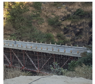
new bridge after Dhundhure