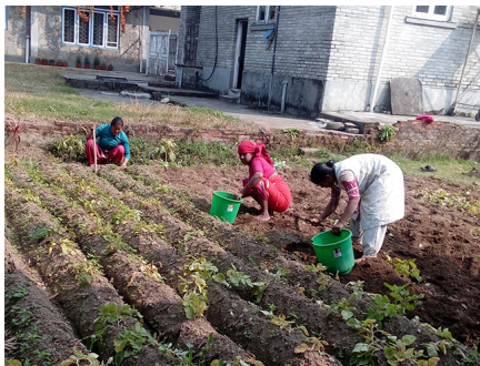
Coworkers and a Sister harvest Potatoes