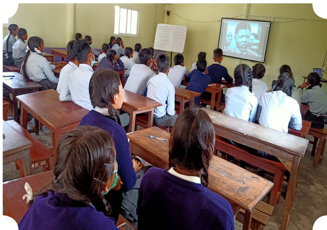
Multimedia teaching-learning exercise

getting ready for the cycle test, which will begin from 28th February onwards.