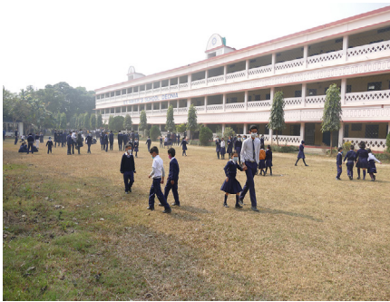
Seniour students guide juniors