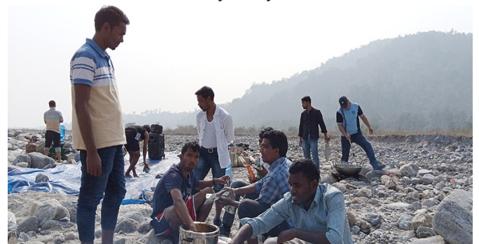
Scholastic picnic to Lohagar