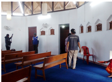
Physical attendance in the church resumes