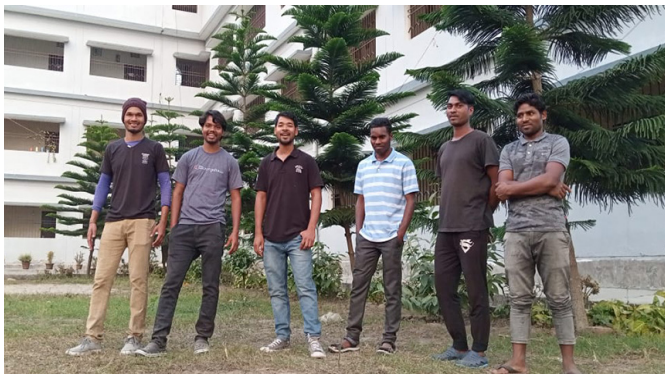
Schoastics at St. Xavier's Rajgang