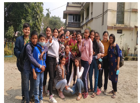
School Eco-club participants