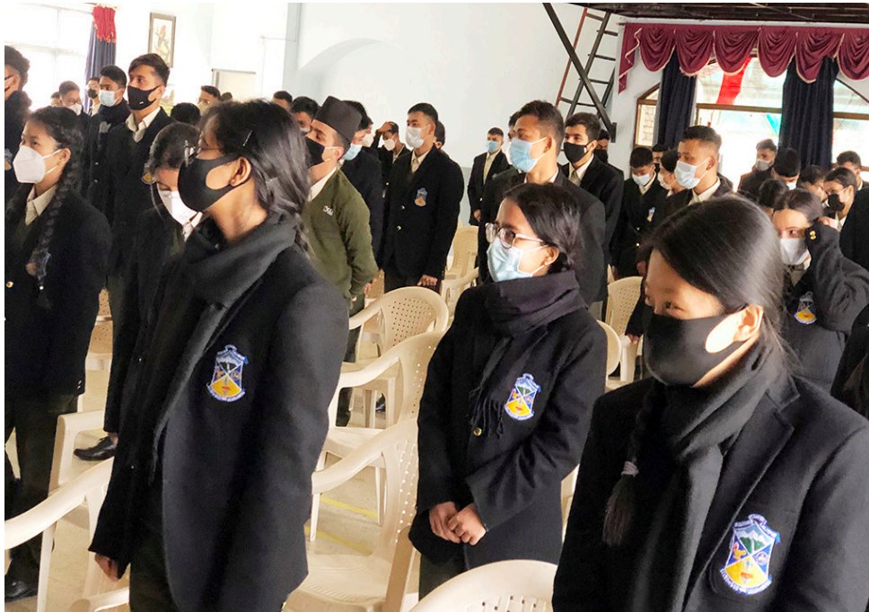
Class 11 & 12 resume attending physical classes