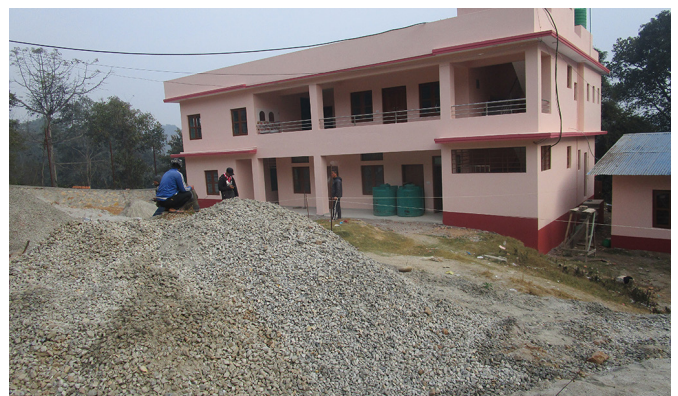
New administrative block, classes, NJSI, Kavre