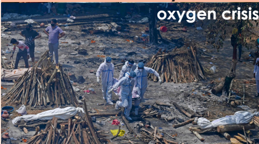
Covid Swallowing People