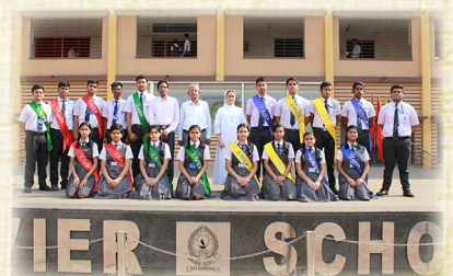
Installation of Student Council