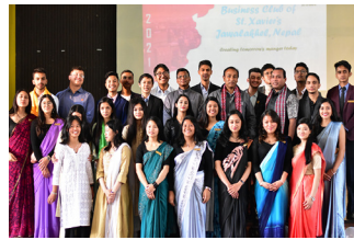
Business club of Plus 2 students