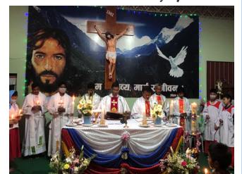
Jesuits of SXJ participating in Easter Vigil mass