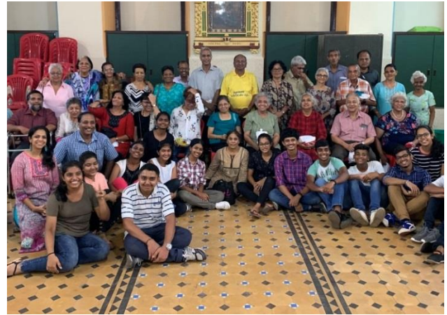
Elders Day at St. Anne's, Mazagaon