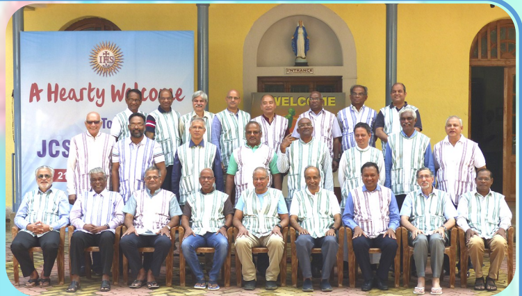
JCSA Group Photo, Ranchi (21-28 October 2019)

<mapsj.information@gmail.com> and a copy to <mapsocius@yahoo.co.in>