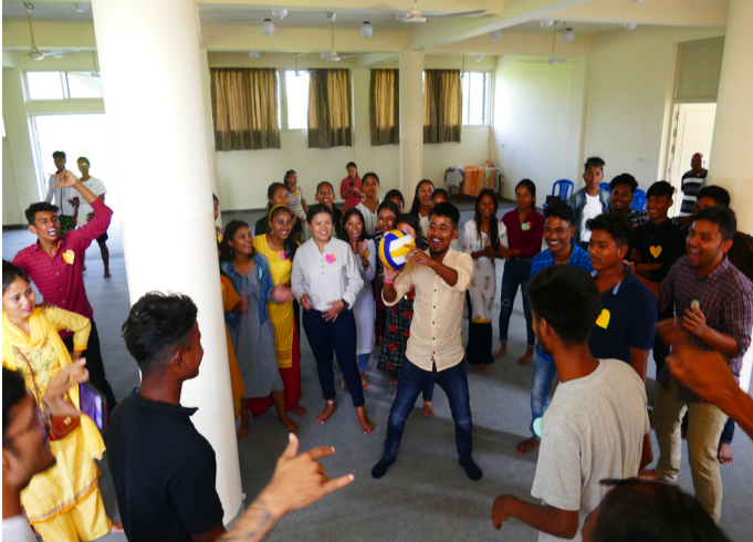
PARISH AND COMMUNITY