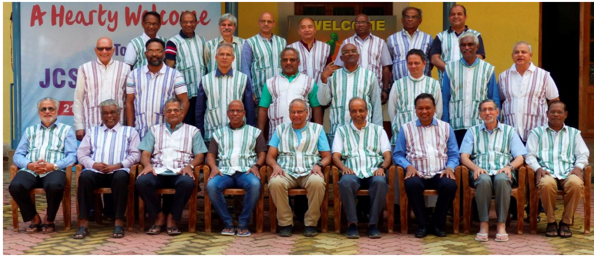
JCSA in Ranchi-October 21-28, 2019