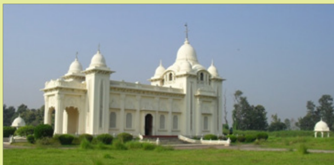
SHRINE OF OUR LADY OF DIVINE GRACE AT MOKAMA