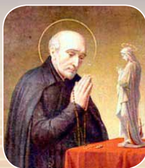
St. Alphonsus Rodriguez