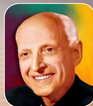
Fr. Pedro Arrupe