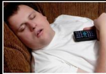
What Our Provincials Think We Do