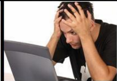
What We Really Do