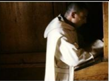
What Our Spiritual Directors Think We Do