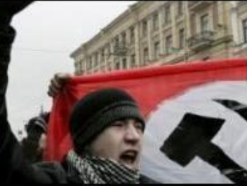
What Conservative Catholics Think We Do