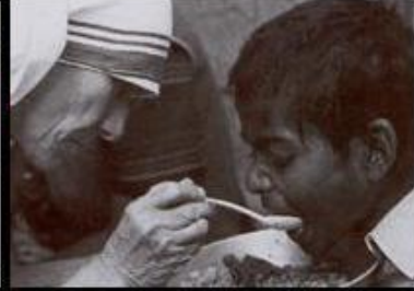
What Our Moms Think We Do