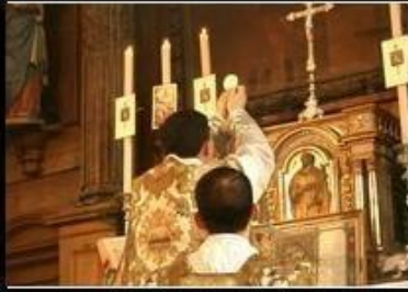
What Liberal Catholics Think We Do