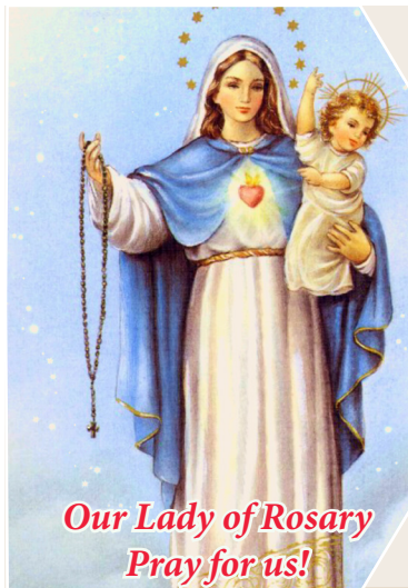
Our Lady of Rosary Pray for us!