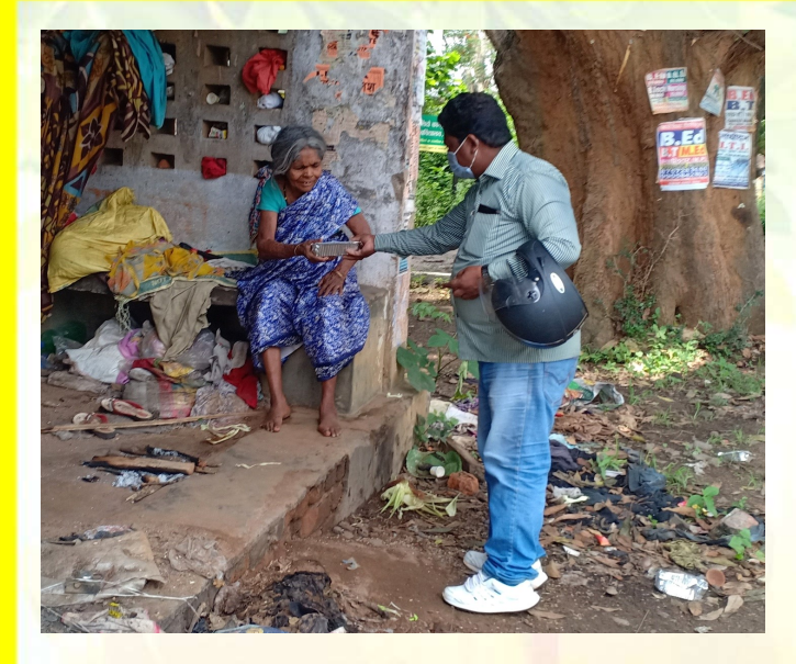
Generous Service of Mariampahar People