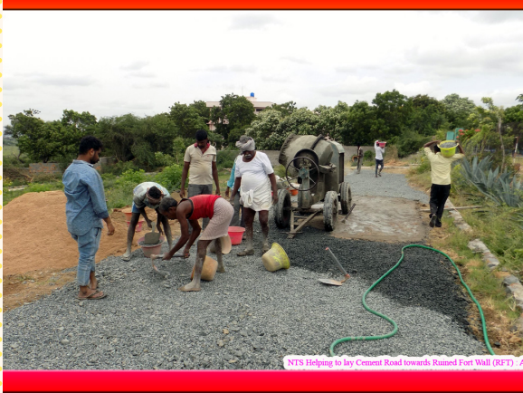
NTS Helping to lay Cement Road towards Rusted Fort Wall (RFT) - A