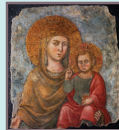
Our Lady of the Way