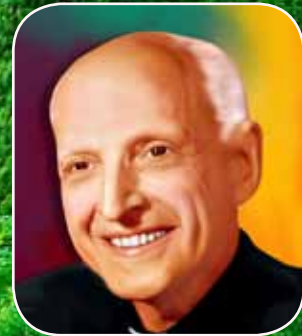
Fr. Pedro Arrupe