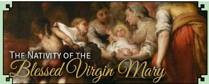
THE NATIVITY OF THE Blessed Virgin Mary

An Environmentally Sustainable Lifestyle : We pray that we all will make courageous choices for a simple and environmentally sustainable lifestyle, rejoicing in our young people who are resolutely committed to this.