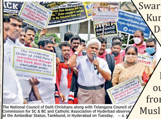
The National Council of Dalit Christians along with Telangana Council of Commission for SC & BC and Catholic Association of Hyderabad observe at the Ambedkar Statue, Tankbund, in Hyderabad on Tuesday.