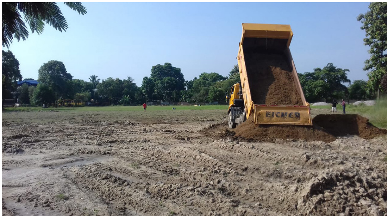
Extention of playing field