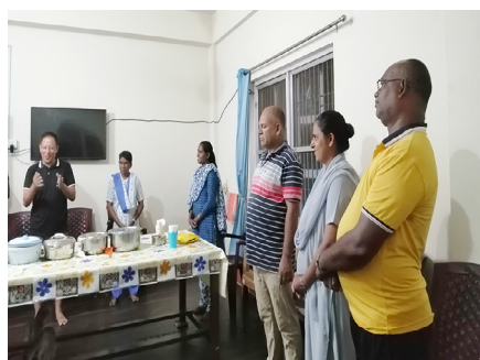
Ganzaga community with St. Anne Sisters

the 13th he met with the staff and also spoke about the Ignatian Year and its importance to them. After the meeting, he wished one of the outgoing teachers