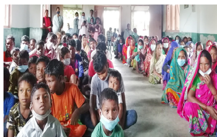
Faithful during mass

the 13th he met with the staff and also spoke about the Ignatian Year and its importance to them. After the meeting, he wished one of the outgoing teachers