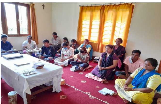
Faithful praying in the SCN convent