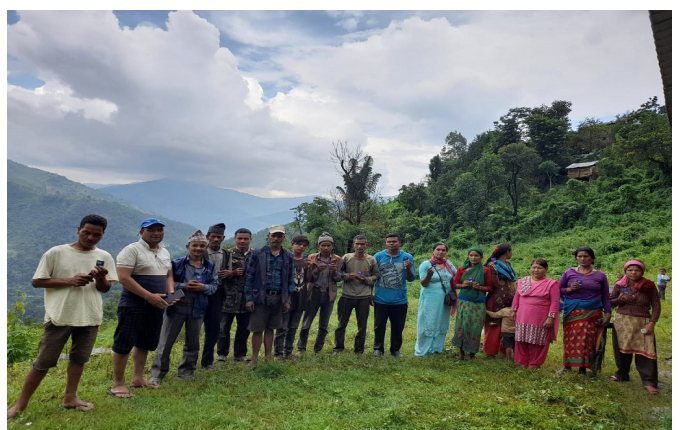
Government school staff, Septi village