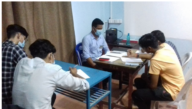
Class 12 promotion test in person

Deonia SJ's joined the Maheshpur SJ's to celebrate the feast-festival of St. Ignatius. A strict