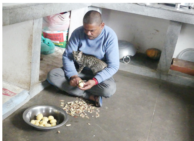
Inmate of Gafney preparing for lunch