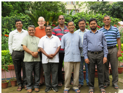
Jesuit community of Jawalakhel