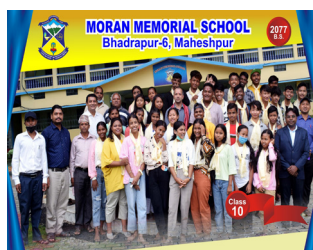
Farewell of Cl. 10