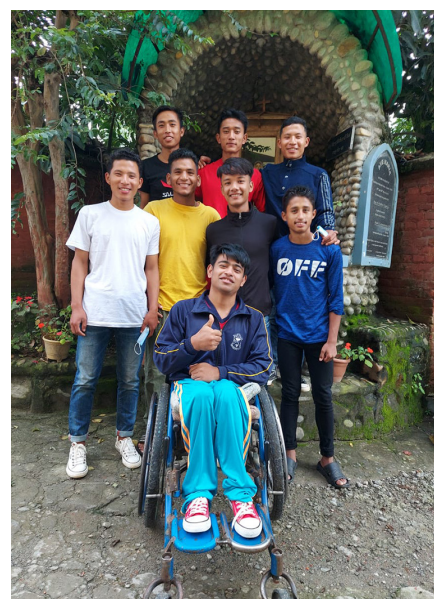
Class ten boys after their result