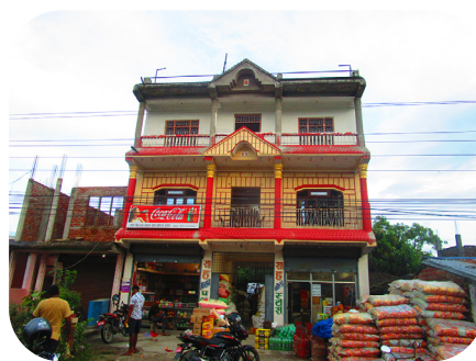
Rented flat in this house