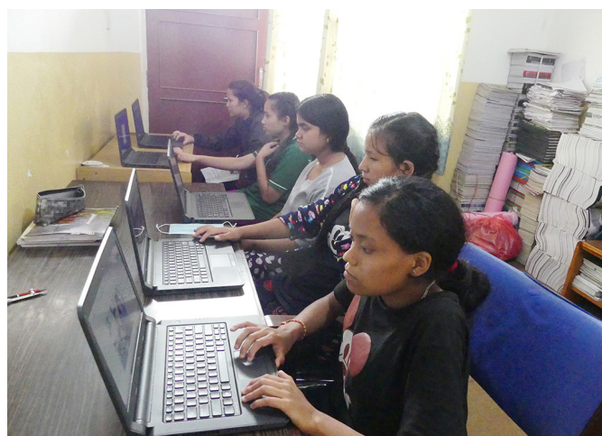
Students trying out new donated laptops