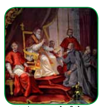
Approval of the Society by Pope Paul III, 'Regimini Militantis Ecclesiae', 1540.