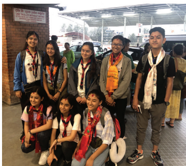
Scout Jamboree in USA.

S XG began the month with a grand celebration of feast of St Ignatius of Loyola. On the 3rd of August our students got their first term result. The same day Scout students returned from World