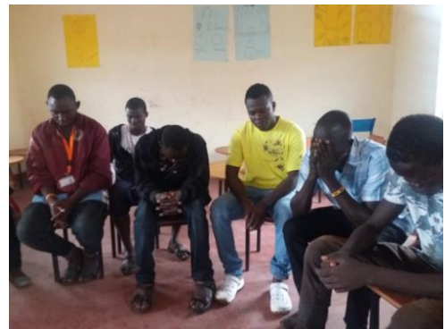
19th Annotation Retreat

The Kenyan government's prohibition of gatherings brought the program at the learning centres of the Children with special needs, the AJAN youth leadership program and the spiritual animation program to an abrupt end.