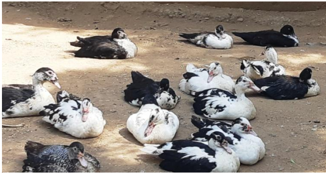
Schools closed Ducks have occupied